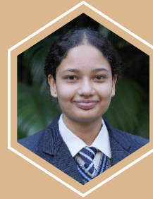
AARCHI (XII ARTS)